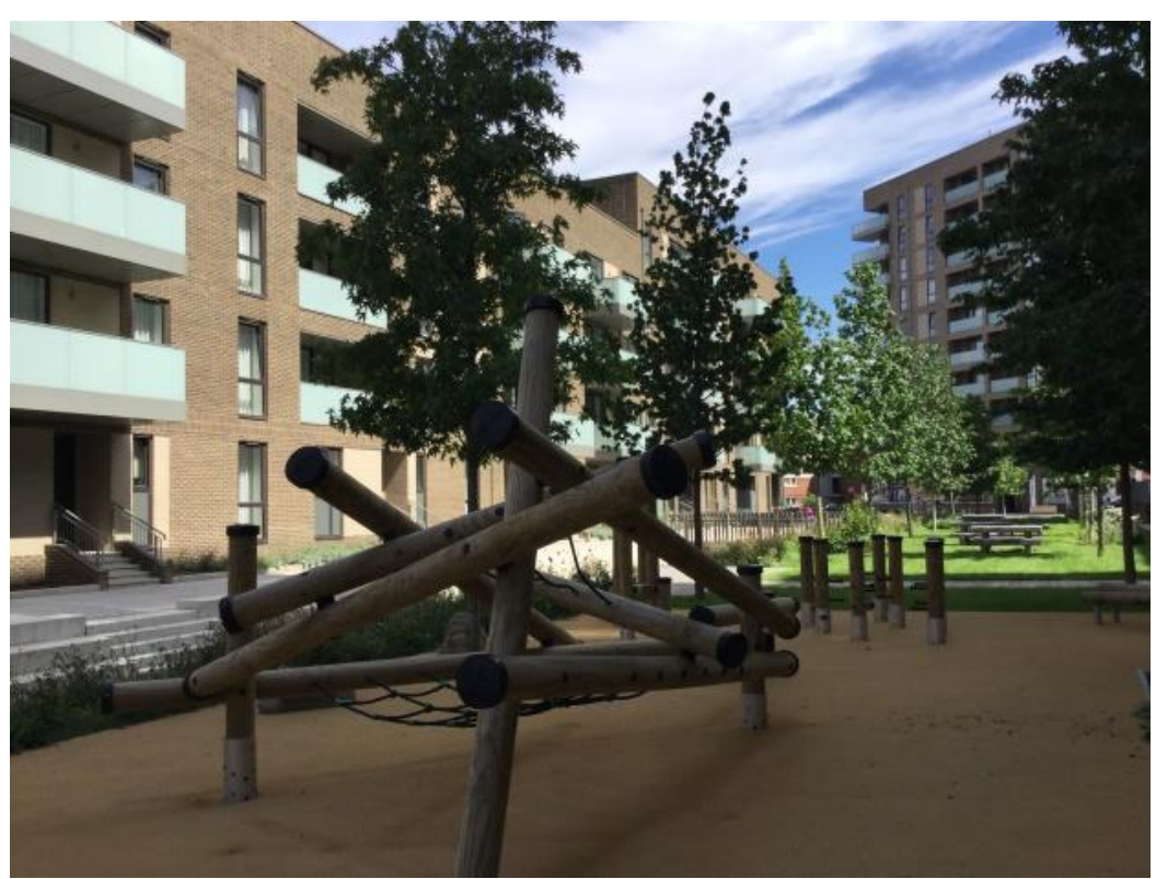
London: Aberfeldy village partnerships housing project.

The theme of affordable housing partnerships is related to the interests of multiple ENHR Working Groups (see above). These Working Groups are joining their efforts during the ENHR 2018 conference by publishing a collaborative call for papers related to Partnerships for Affordable Rental Housing. During the ENHR 2018 conference the Working Groups will organise a joined kick-off workshop to describe the 'state of the art', and a concluding session to capture synergies, discuss emerging initiatives and explore future collaboration on Partnerships for Affordable Rental Housing . Based on their specific topics, submitted papers will be allocated to the kick-off session or workshop sessions of the respective Working Groups.